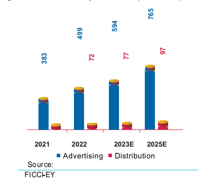
Digital Media Industury Revenue (in INR Bn)

segment generated revenue of INR 68 billion in 2022 through 99 million paid subscriptions across 45 million households.